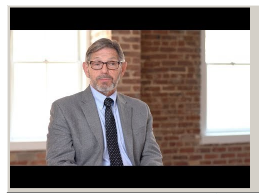
Video hosted on Youtube http://youtu.be/-Rrnep5_f4Q Closed Captions

Use these recommendations in the classroom.