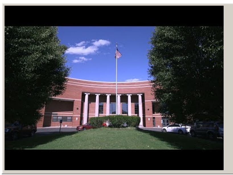
Video hosted on Youtube http://youtu.be/L6Kxd5Dp6K8 Closed Captions

Teaching social and emotional learning as part of literacy lessons has a significant impact on students' learning and wellbeing.