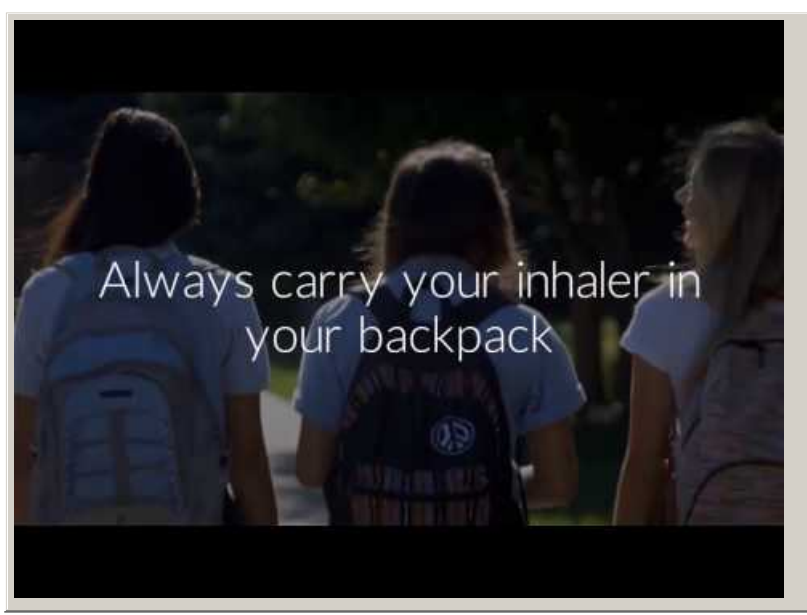
Video hosted on Youtube http://youtu.be/qqGpV7xC5jQ

Use the school asthma checklist as part of your enrolment process to help reduce the risk of asthma related illness at school.