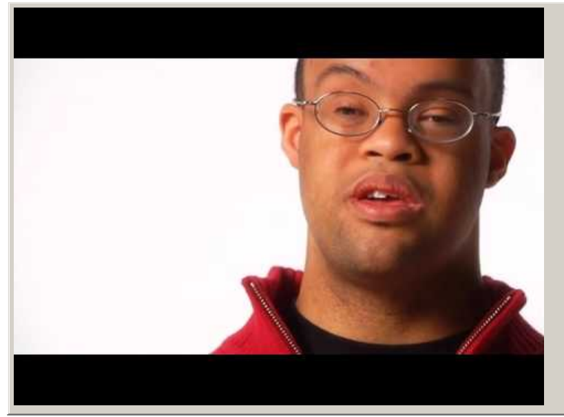
Video hosted on Youtube http://youtu.be/-cA3t1HW1Ow Closed Captions

Be guided by the student and their whānau.